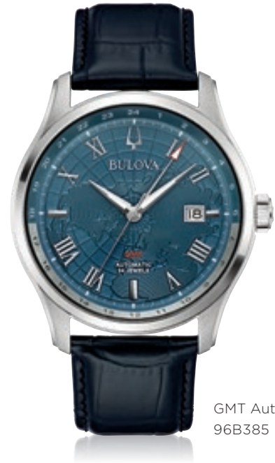
GMT Automatic 96B385

The Bulova Wilton GMT Automatic is the ultimate timepiece for avid travelers and fine watch enthusiasts who appreciate an elegant timepiece with the sophisticated design of a dual time movement.